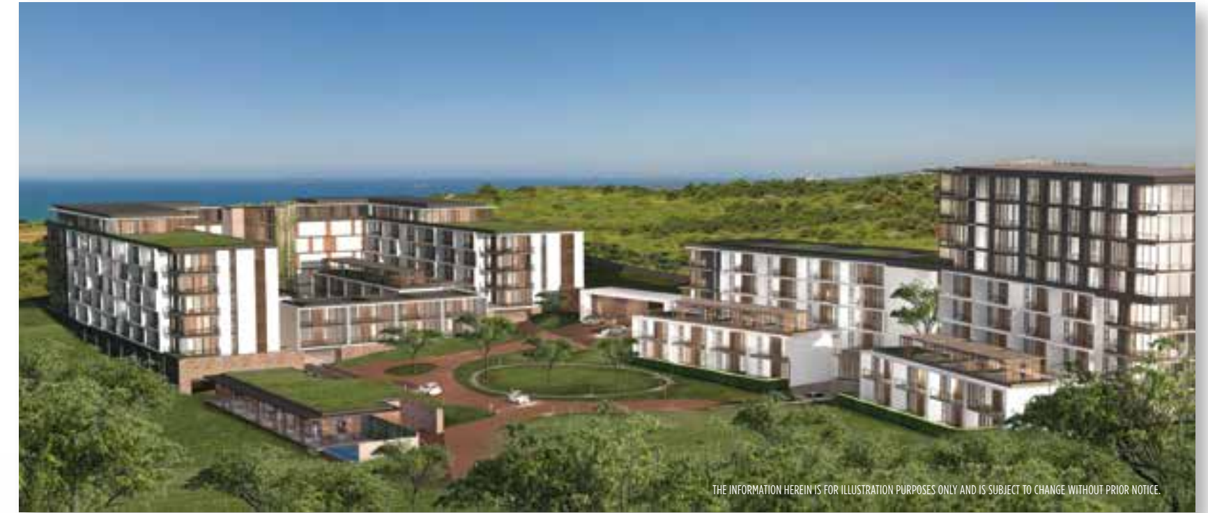
THE INFORMATION HEREIN IS FOR ILLUSTRATION PURPOSES ONLY AND IS SUBJECT TO CHANGE WITHOUT PRIOR NOTICE.